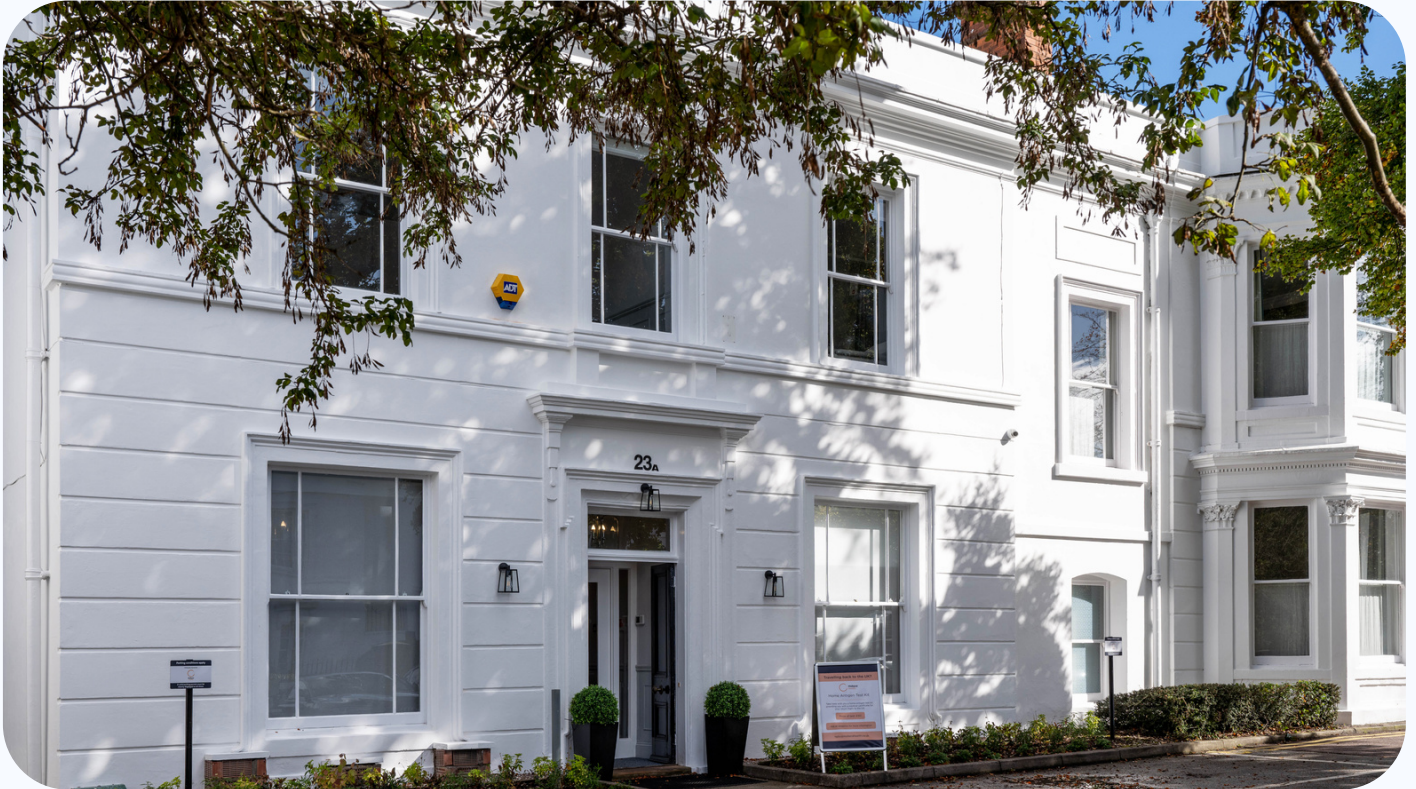
Midland Health Edgbaston Clinic 23a Highfield Road Edgbaston Birmingham B15 3DP